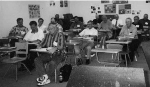
Committee #2 in session in a classroom

The theme of every Convention could well be "the Blessed Ministry of Reconciliation." As ambassadors for Christ, we have joined together in the CLC to carry out this ministry of reconciliation. Why have we at times debated over the proper meaning and application of God's Word? Because it is our desire that all our work as a church body proceed on the basis of unity of faith and confession. "Can two walk together unless they are agreed?" (Amos 3:3) So we "reconcile" our doctrine, that we may "all speak the same thing, and that there be no divisions