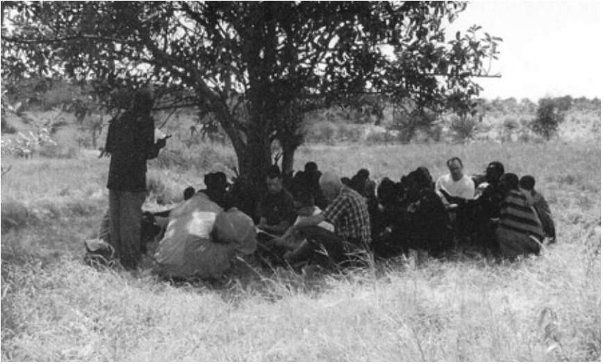
Mission Helper Team worships with the Maasai tribe