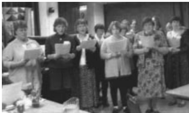
Ladies Choir at Mankato Seminar

On display: Photos on mission work in Nigeria; craft ideas for Vacation Bible School