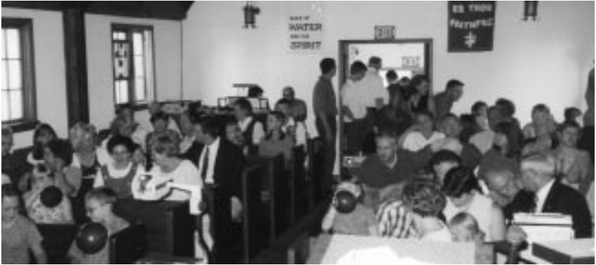
Celebrating a 50th Anniversary--