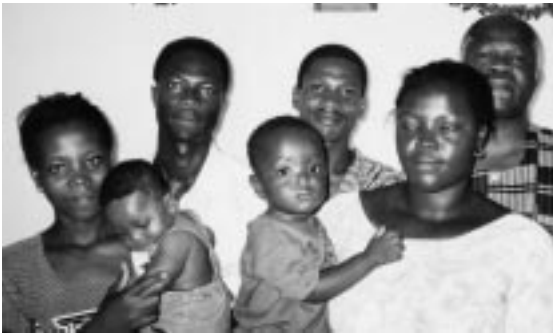
Missionary Koenig submitted these photos. This one shows participants in a Baptismal service at Denu, Ghana, April 2002.