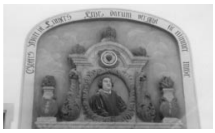
Luther Memorial, Eisleben, Germany; translation: "God's Word is Luther's teaching; therefore this teaching will always be."

That very same spirit is behind every true Reformation, as it was also in the days of Luther. To begin with, Luther thought not even of quarreling over religion with anyone. But Luther found himself face-to-face with the very conditions that had brought forth