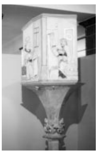
Luther pulpit, Wittenberg