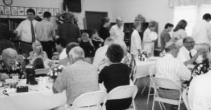
A thankful congregation notes fifty years at Immanuel, Winter Haven

of the Lutheran Confession was organized, Immanuel of Winter Haven became one of the first mission congregations supported by the newly-formed synod.