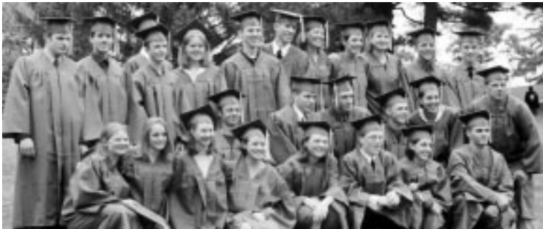
2002 ILC High School Graduates (story p. 16)

This should serve as a stern warning to those who are not content with the free gifts God has already given them. In 1 Timothy 6:10 we read, "The love