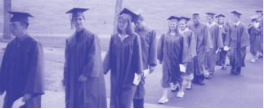
High School grads proceeding happily (?) to graduation exercises