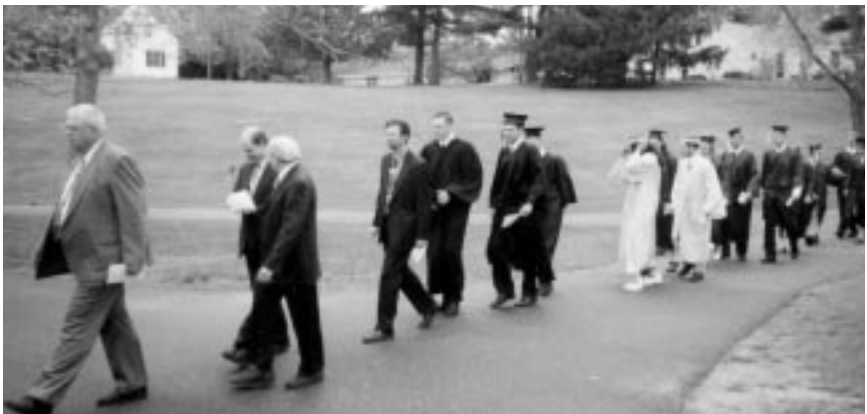
ILC Professors leading 2002 Seminary, College, and High School graduates toward the Fieldhouse for graduation exercises