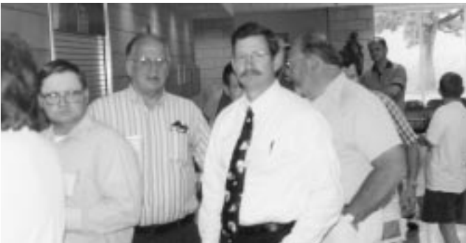
Delegates in food line-up at the 2000 Convention

How do you know the direction your life will take? Will you meet the