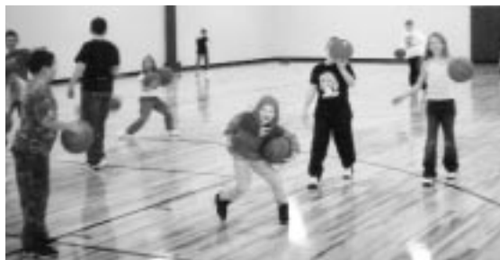
Students at Faith Lutheran School enjoying the new facility.

continually under construction. As each new person is brought to faith in the Lord Jesus, the structure becomes more and more complete, until that day when the final soul which God has sought out for His kingdom is found, and our Lord returns for judgment.