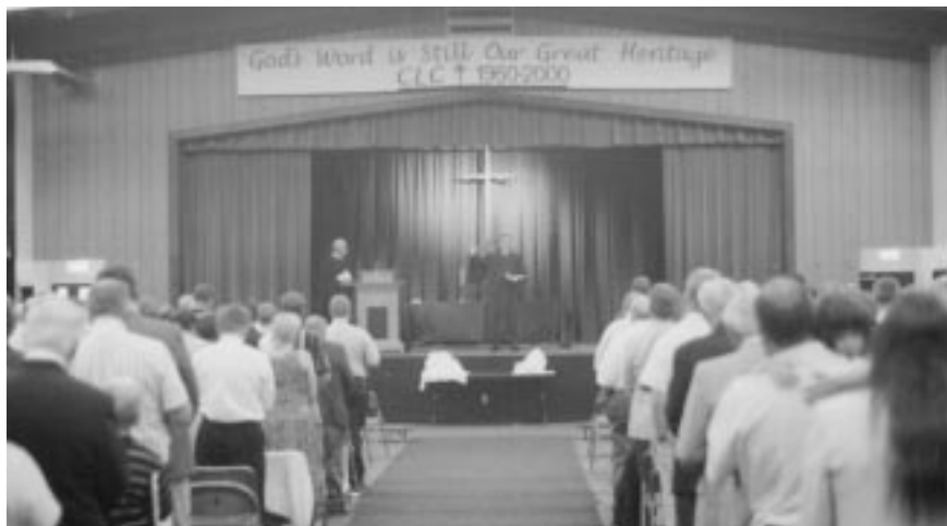
2000 Convention Communion Service

and redirect us, that we might offer a respectful ear to the counsel of others and a tender heart to their needs.