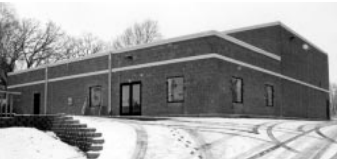
Berea Activity Center, Inver Grove Heights, Minn. (story, p. 18)

It is clear from Scripture: any self-ordained bottom-line pursuit of the church that is not true to God’s purpose and truth means that the consumer is always hurt.