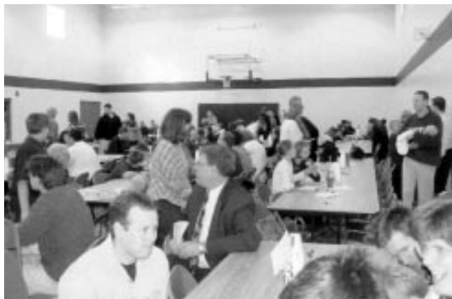
Dedication Day in the new Fellowship/Gym area

tion is deeply grateful to the CLC Board of Trustees for accommodating both the need and the timing of our Church Extension Fund loan request.