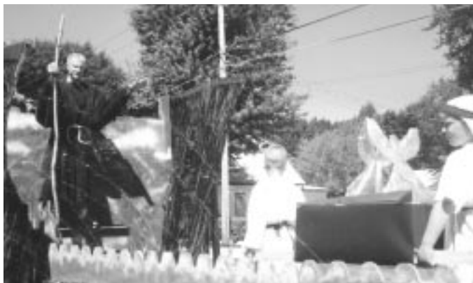
Moses parting the Red Sea