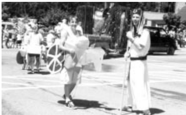
Pharaoh and his Egyptian army chase the Israelites (see VBS story, p. 17)

We can say with our brethren in the CLCI, Great is the Lord, and greatly to be praised for His work among the heathen. Pray for our brethren in India to continue in this most important work on the face of the earth.