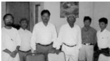
CLCI Representatives at the Joint India pastoral Conference

‘Farewell to 2001’ in December was a real hit. 200 boys attended this one-day camp in Nidubrolu. It was thrilling when 25 youngsters came forward to commit to fulltime ministry, and to join our CLCI seminary for Bible training. Similar programmes in Mudinepalli, Kakinada drew several hundreds of boys. . . . Discipleship Camps served as a follow-up. The VBS-2001 was quite