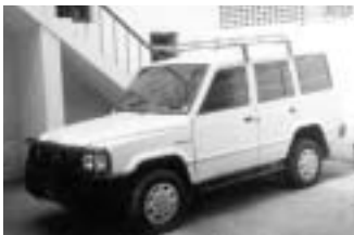
...this Tata Sumo for the CLCI