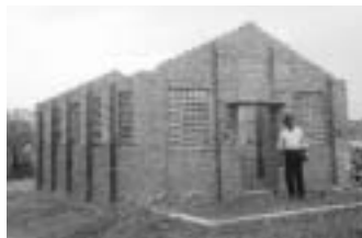
...a future roof for churches like this in India