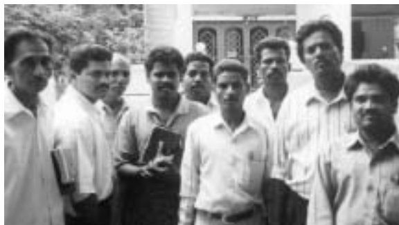
New group of pastors at Ambattur, Chennai area, India, study each Saturday to become part of the Bharath Evangelical Lutheran Church (BELC)

Participants (including the Mission Helper Team) in the first Joint English Pastoral Conference of the CLCI and BELC in Chennai; another conference is planned for next year in Guntur.