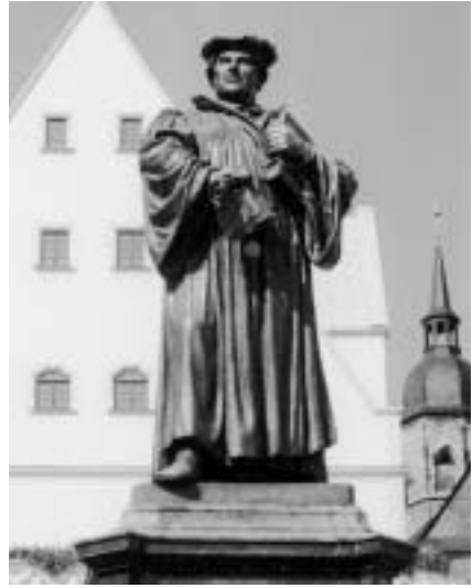
Luther Memorial—Bible in hand, Eisleben

As Lutherans we don't worship Martin Luther or any other man. We Lutherans have not exchanged a Catholic pope for a Lutheran pope. . . . Luther—and we—have recognized that it was the hand of God directing the events of the Reformation.