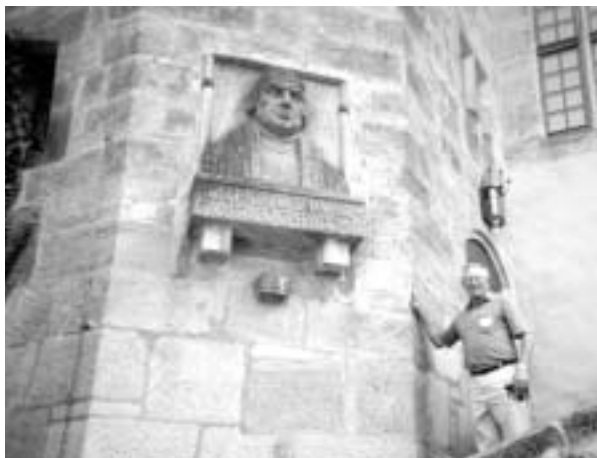
Your editor next to Luther bust on Coburg Castle. Translation of Latin subscription: “I shall not die but live, and declare the works of the Lord.” (See Psalm 118:17)

Christians such as we are can't help but come away with a renewed appreciation for what Almighty God in His grace brought about with the sixteenth century Lutheran Reformation. Just on the face of it, what courage it took for God's instrument Dr. Martin Luther to stand up publicly and call attention to the unbiblical (superstitious!—how often our guides in Rome and elsewhere remarked: “Tradition says that . . . Legend has it that . . .”) teachings and practices of the church whose base is in Rome, whose anti-Christian tentacles were spreading—and have spread—bit by bit throughout the world. What spiritual courage it took for this young monk in “faraway Germany” to challenge the very institution of the deeply rooted and firmly established church of Rome, and with that to challenge the authority of the Papacy!