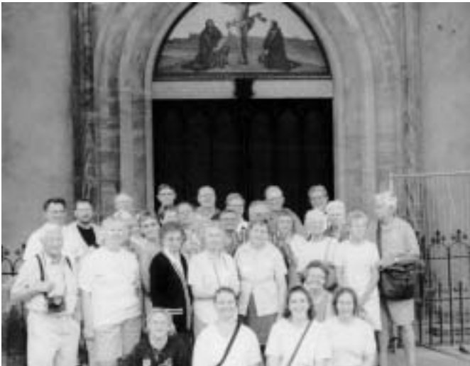
Tour Group in front of the “Theses Door,” Castle Church, Wittenberg. No access to the church since it was being renovated