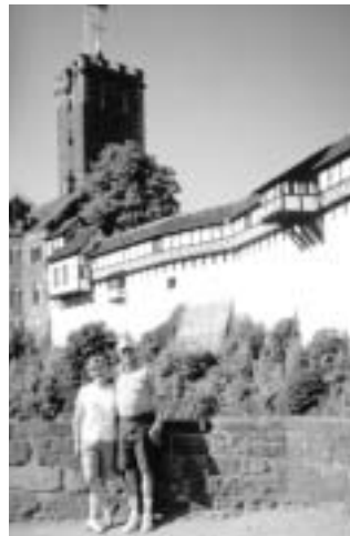
Editor & wife at the Wartburg Castle