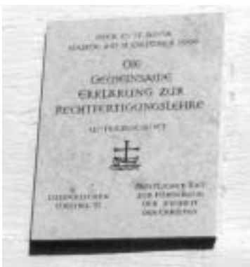
Plaque on St. Anne’s Church, Augsburg, Germany, dated October 31, 1999, and marking the ELCA and Roman Catholic Accord of that year. See comments in SMORGAS-BORD section