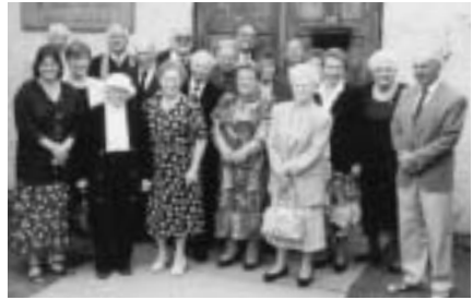
Resurrection congregation, Calgary