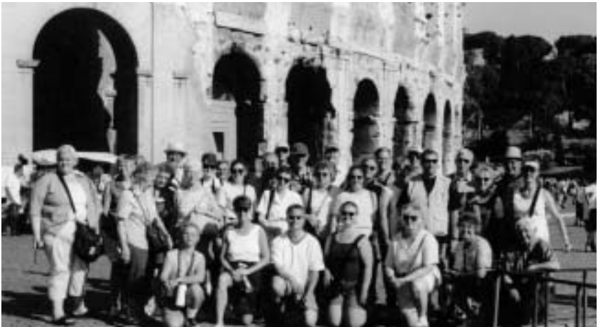
Tour Group at the Roman Coliseum