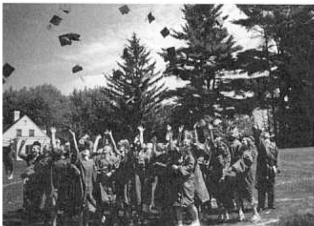
High School Seniors caught in the act of throwing mortarboards

Lord's Word responded: "I am the Alpha and the Omega, the Beginning and the End," says the Lord, "who is and who was and who is to come, the Almighty." As our life bounces forward minute by hour by day—always in transition from what was to what is and then onward to what shall be—our Alpha/Omega God manages. The only reason we are here today and are moving on—is Jesus. We step from past to