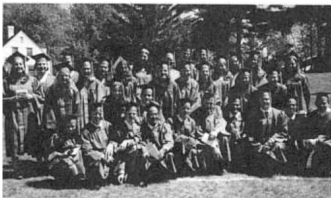
Eau Claire Immanuel Lutheran High School graduates on their big day, May 19, 2001. See story, p. 17

And this is the verdict: "He is not fit for the kingdom of God." He cannot think and do anything which pertains to the kingdom of God, nor can he be a follower of Christ, nor a Christian at all. Do not deceive yourself, you pitiable friend-of-the-world. Do not think for a moment that Christ will accept at full value your cheap and