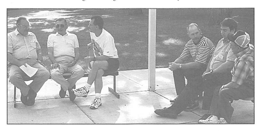
Discussion at convention is more relaxing on the outside than it is on the inside.