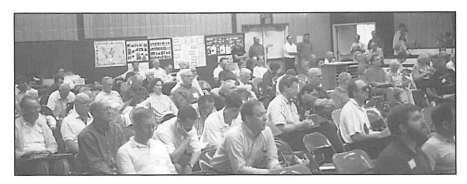
Though they may not have a vote, the 'back row' crowd at convention are interested observers.

The first thing to remember in these three references is that the contribution spoken of was not regular church offerings. This was the collection made for the brethren in Jerusalem when they suffered physical deprivation. We may use these references or parts of them to