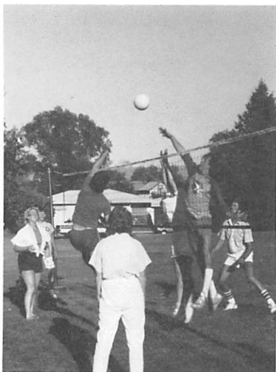
Action was fast and furious on the sidelines.

ing Poor Readers" reminded them that "The goal of all reading is understanding what the author wishes to communicate," and gave them suggestions on ways to help readers achieve this understanding.