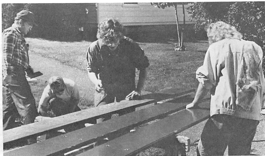
Assembled workers finishing disassembled bleachers.

Lutheran Alumni Association (ILAA) for their assistance.