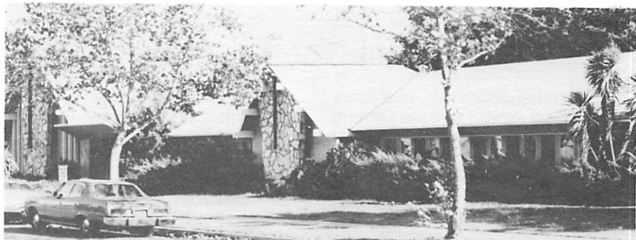
The Conoga Parish Property

market for the very modest asking price of $200,000, the continued availability of the school facility on a rental basis is not guaranteed. So there