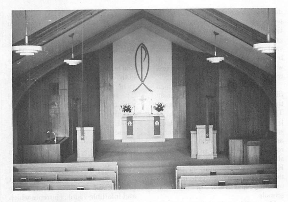
Sanctuary of St. John Lutheran Church, Clarkston, Washington