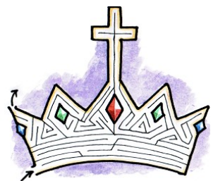
Jesus is Our King!

What a blessed privilege it is for us to know Him and believe in Him as Lord and Savior now in this our time of grace. To us the kingship of Jesus is a great comfort. Jesus in whom we trust is Lord. He died for us to redeem us from sin and condemnation. He lives to bring us safely to the end of our days and to take us to be with Him. When He comes again in glory it will be to welcome us into the eternal mansions that He has prepared for those who love Him.