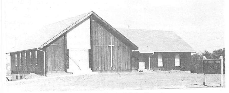
Faith Lutheran Church, Ballwin, Missouri

shipping congregation of 100-120 people. The land-contour allowed for a full walk-in basement which adds much economical space to the whole plant.